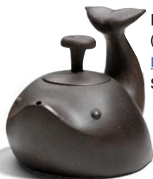
Baleen Whale Teapot (10 oz.) ITEM No.800746 $28.00