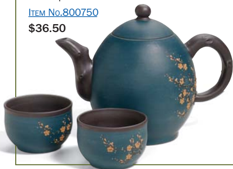
ITEM No.800750 $36.50

The striking color of this Yixing teapot and cups is the perfect complement to Asian décor. Hand crafted and hand painted, this set is an ideal example of Yixing artistry. Teapot holds 20 oz., and cups hold 3 oz.