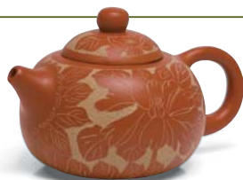
Red Flower Teapot (16 oz.) ITEM No.800752 $30.00

Whimsical works of art yet completely functional, Yixing (pronounced ee-shing ) teapots first appeared centuries ago in the Yixing region of China. This region is the world's only source for the unique clay, called purple or red clay, from which these teapots are made. Yixing teapots are particularly valued due to the porous nature of this clay. Since the inside of the teapots is left uncoated, they eventually absorb the flavor, smell, and color of the tea. In addition, the clay, once fired, contains tiny air pockets that provide insulation and enhances the taste and aroma of fine tea. To clean, rinse with plain water and air dry.