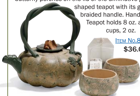
ITEM No.800751 $36.00

Another must-have for the Yixing aficionado—a small butterfly perches on the lid of the diminutive gourd-shaped teapot with its gracefully braided handle. Hand wash. Teapot holds 8 oz. and the cups, 2 oz.